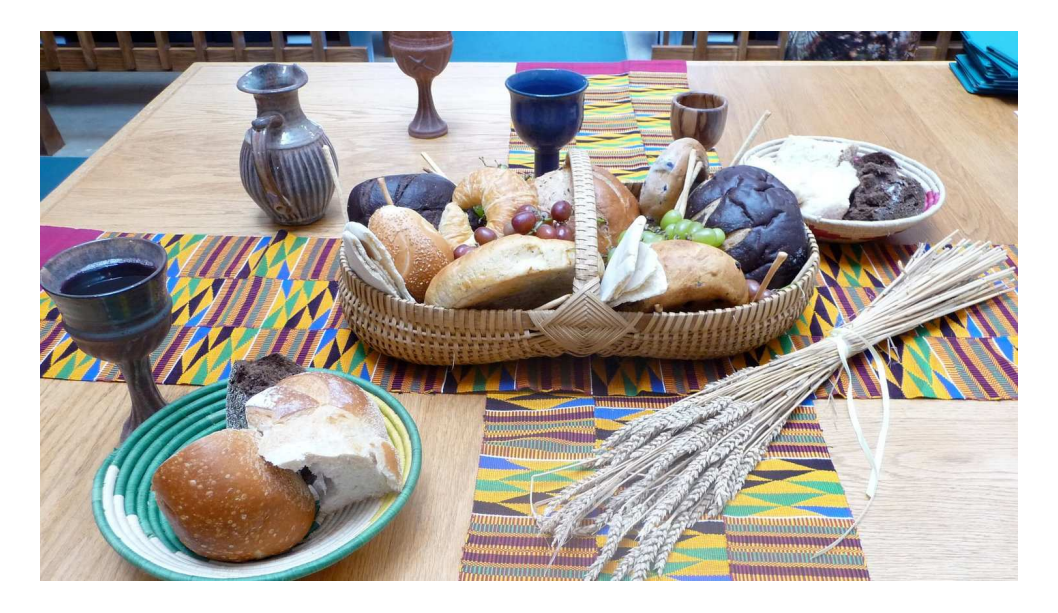
Mark Your Calendars **Morld Communion Sunday** October 6, 2019

Sunday, October 6 th will be a big day as we celebrate our ministry to and with women, with our first ever Presbyterian Women Sunday . Our service will be led by our women and will be based on a service outline that has been suggested by the national Presbyterian Women office. The service will also include the Sacrament of the Lord's Supper (see below). Mark your calendar for this unique service which is certain to be uplifting and engaging!